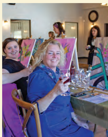
PAINT & SIP $45 per person

Our resident game night professional will execute a fun and engaging experience for your guests! Options include Trivia, Music Bingo, Family Feud or Wheel of Fortune.