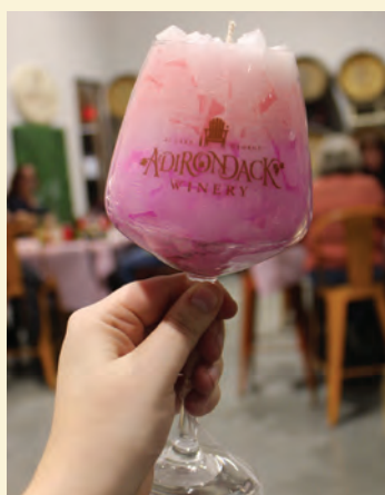
CANDLE MAKING $35 per person

Includes 2 hours of instruction with a professional painting instructor to create a themed painting on a Canvas or 2 Large Wine Glasses that your guests get to take home with them! Supplies provided.