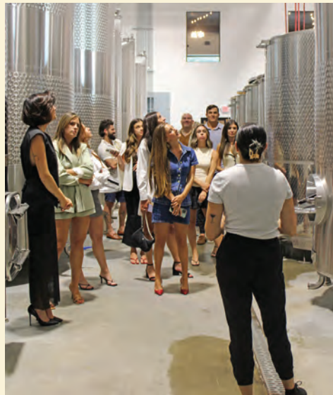
WINERY TOUR $5 per person

An experienced winery associate will guide your group through sampling 7 wines ( pre-selected, dry & sweet options ) and guests keep the souvenir glass. *$15pp if Souvenir Glass is Excluded *Add'l associate fee for parties of 25+