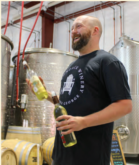
WINE TASTING $20 per person

An experienced winery associate will guide your group through sampling 7 wines ( pre-selected, dry & sweet options ) and guests keep the souvenir glass. *$15pp if Souvenir Glass is Excluded *Add'l associate fee for parties of 25+