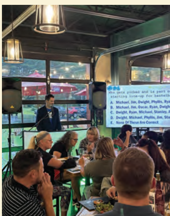
LIVE GAMES Pricing Varies

We will hire a Live Musician for your event that has been vetted by our trusted provider. Musician will play for the duration of your event ( min 3 hrs, max 4 hrs., including one 15-minute break per hour )